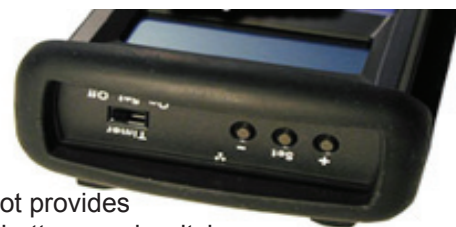
The open endpanel of the optional Xtreme Boot provides easy access to the buttons and switches.