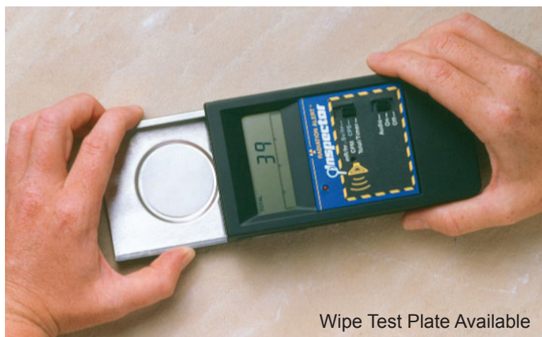
Wipe Test Plate Available